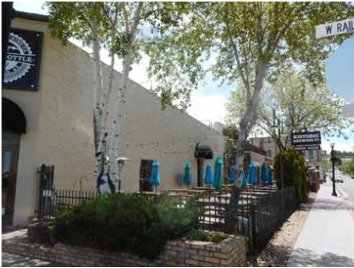
Figure 11: Landscaping