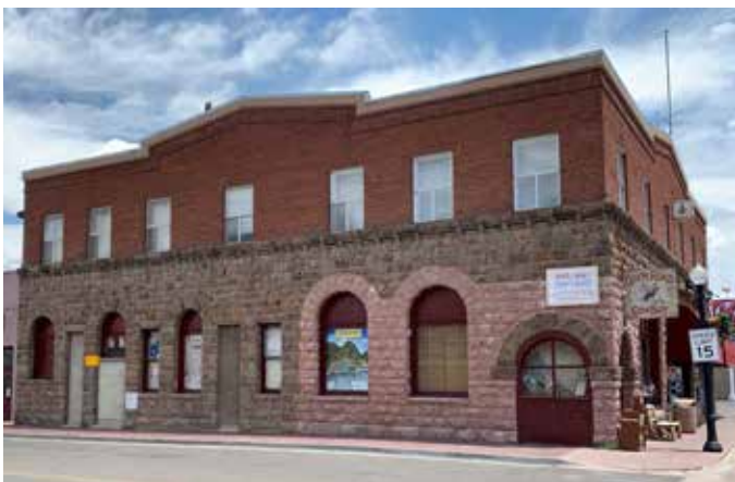
Figure 17: Second Floor Vertical Windows