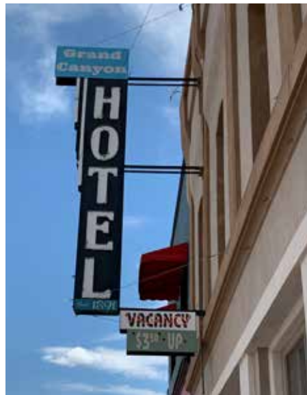
Figure 40: Projecting Sign