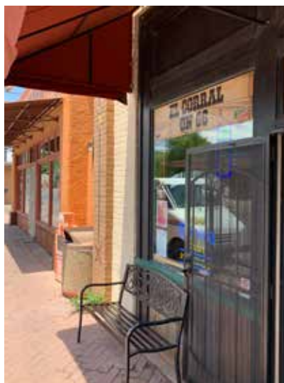
Figure 30: Wood Trim