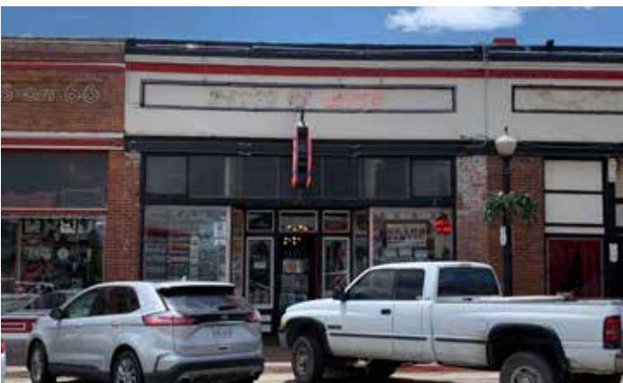
Figure 29: Stucco (as an accent only)