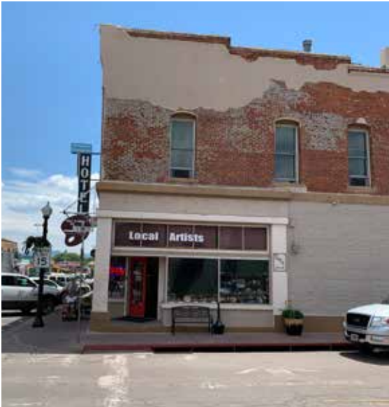
Figure 9: Storefront