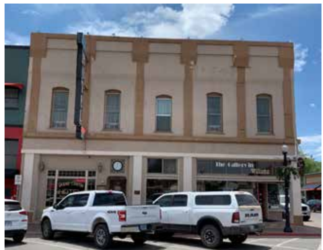
Figure 6: Windows