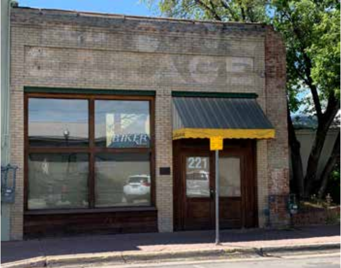
Figure 12: Preservation of Existing Facade