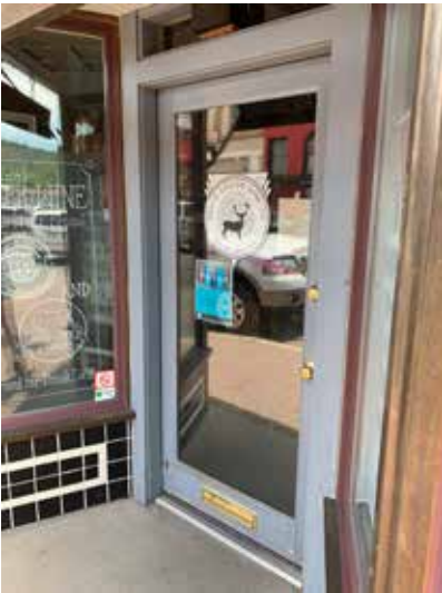
Figure 23: Wood Door