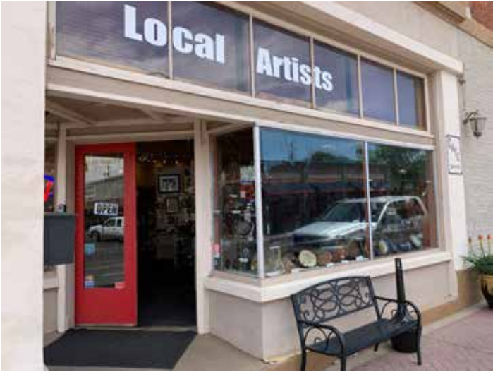
Figure 10: Storefront