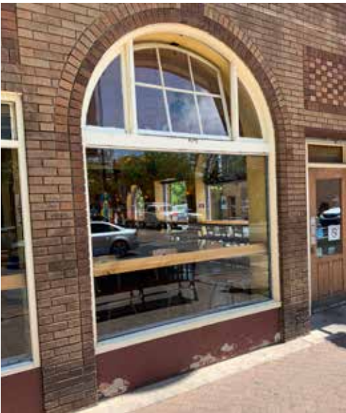
Figure 15: Preservation of Original Wood Window