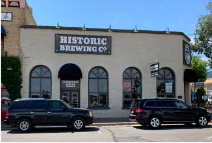
Figure 37: Building, Window and Projecting Signs