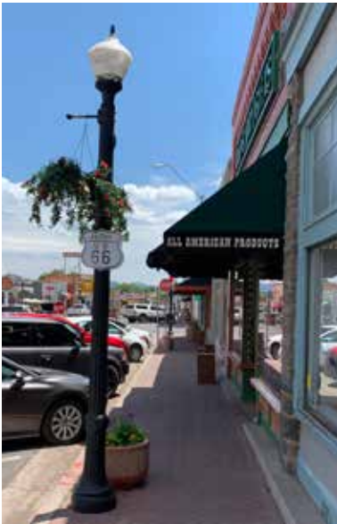
Figure 39: Awning Sign