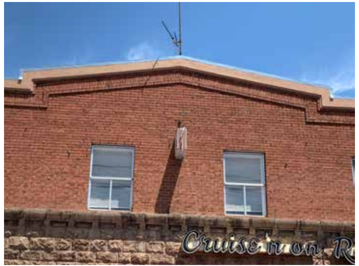
Figure 32: Parapet