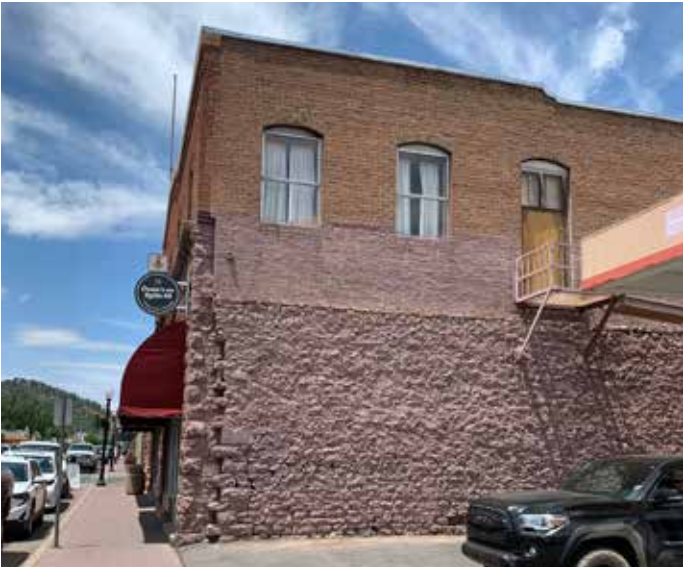
Figure 25: Mixed Masonry Types (brick and stone)