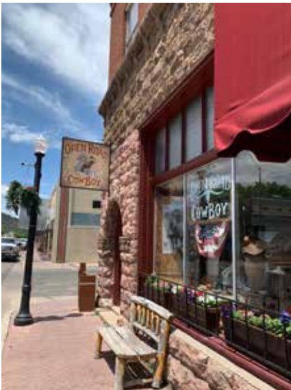
Figure 7: Storefront