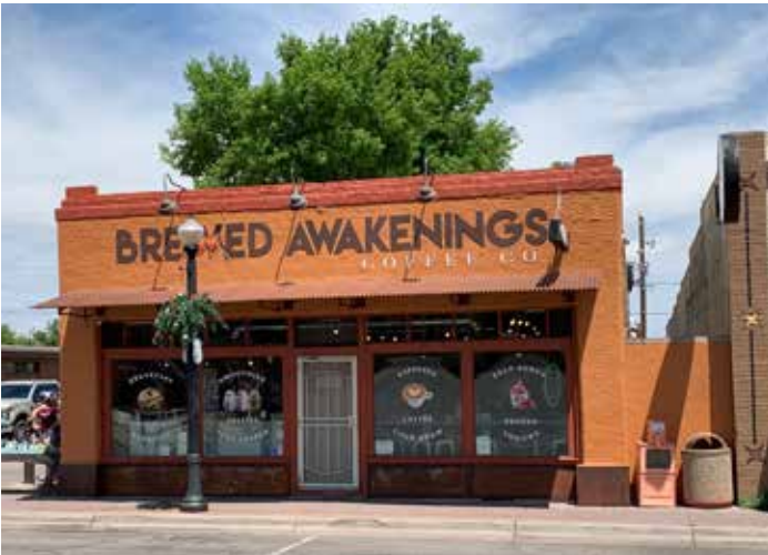
Figure 27: Painted Brick Facade (acceptable but unfinished preferred)