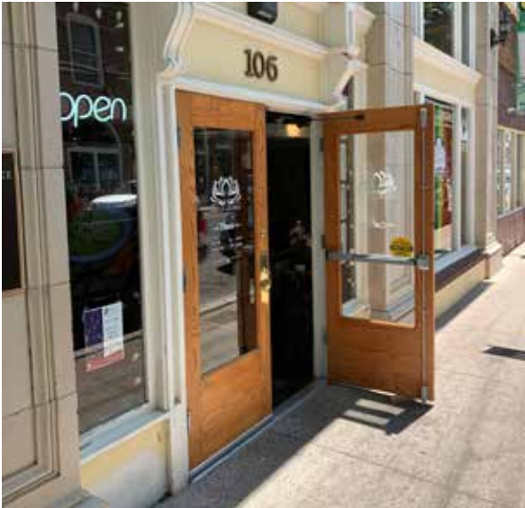
Figure 22: Wood Door