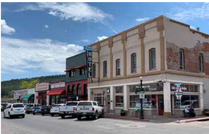
Figure 3: Typical Roof Parapets