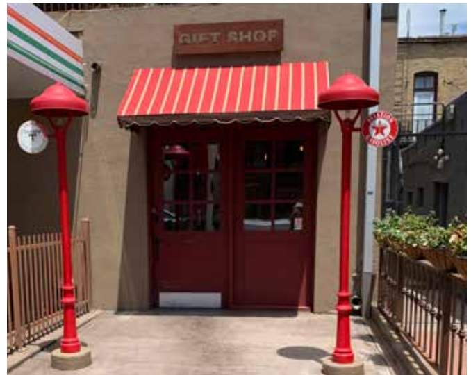
Figure 34: Awning over Doorway