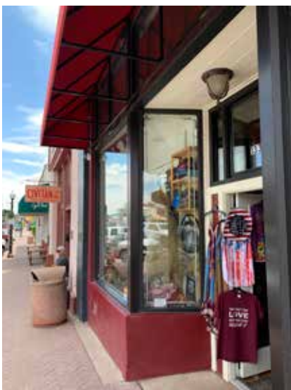
Figure 5: Storefront and Transom Windows