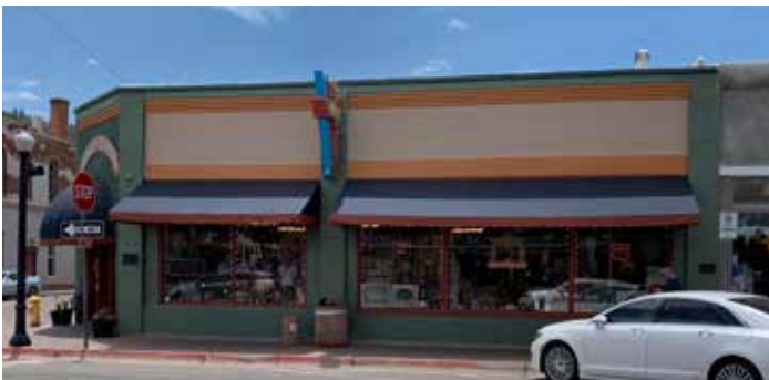
Figure 35: Multiple Awnings over Doorway and Storefront