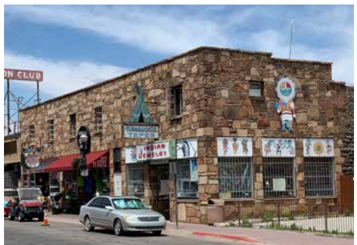
Figure 42: Natural Stone (signage and awning as color accent)