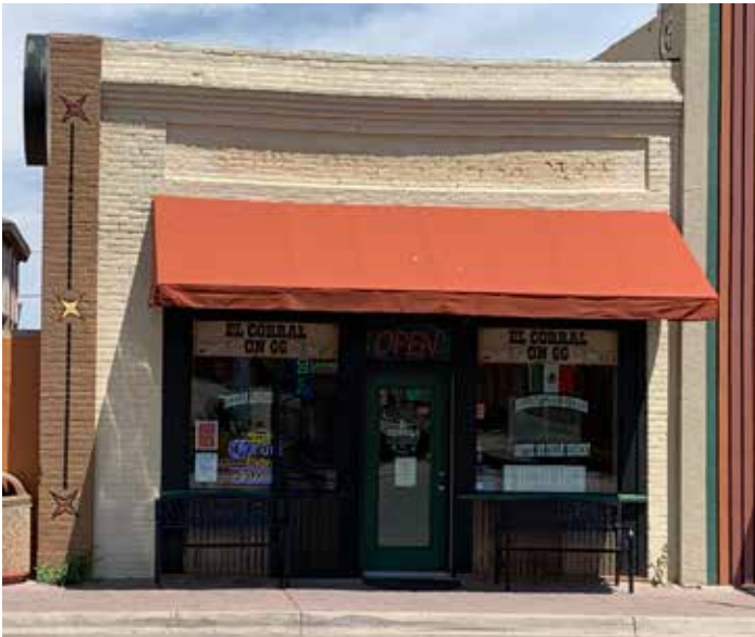
Figure 33: Awning over Storefront