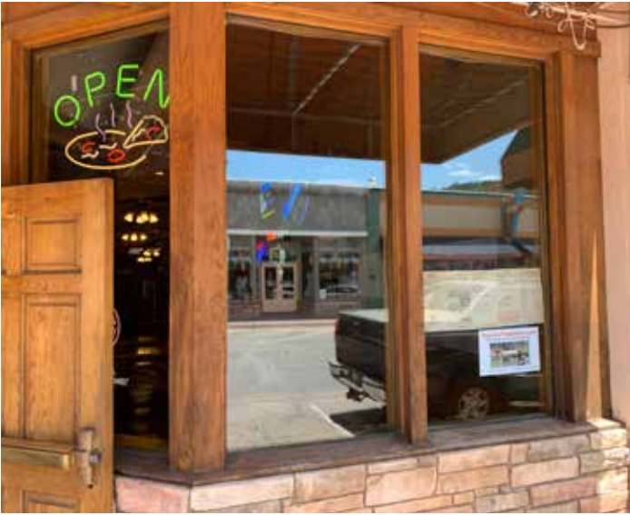
Figure 31: Wood Trim