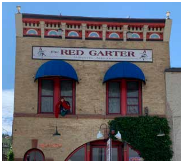
Figure 36: Second Floor Awnings