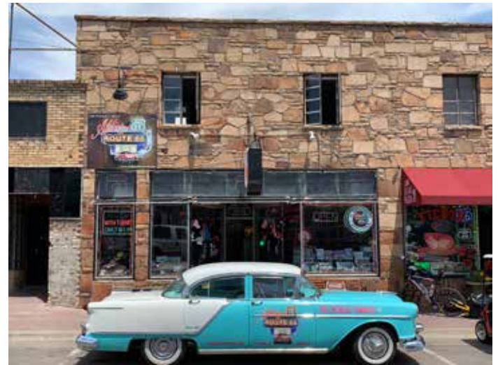
Figure 28: Stone Facade