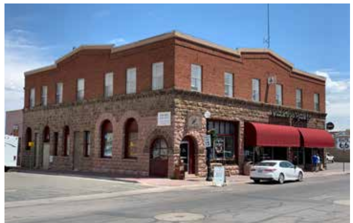
Figure 4: Windows