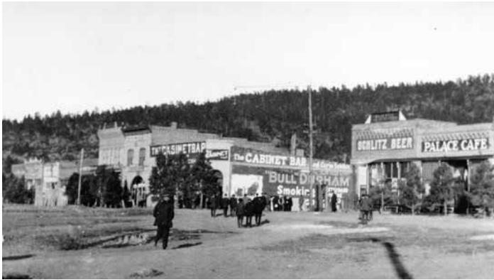
Figure 1: Downtown Williams 1914