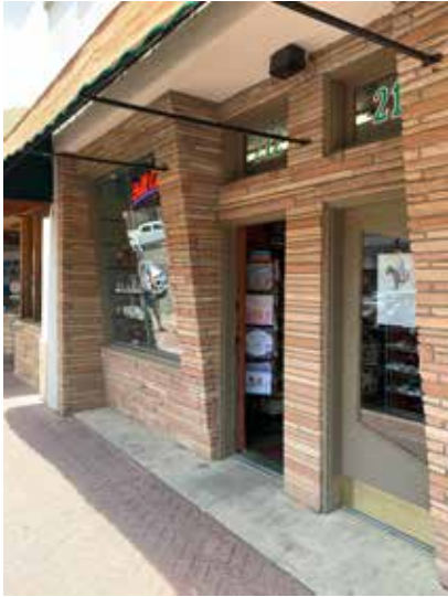
Figure 24: Stone Veneer