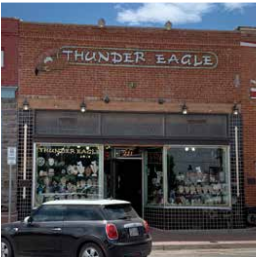
Figure 41: Neon and Window Signs