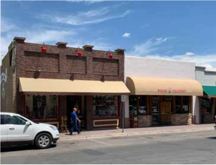
Figure 13: One-Story Building Massing