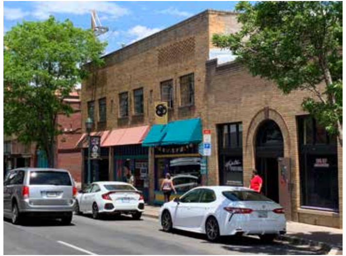
Figure 14: Two-Story Building Massing