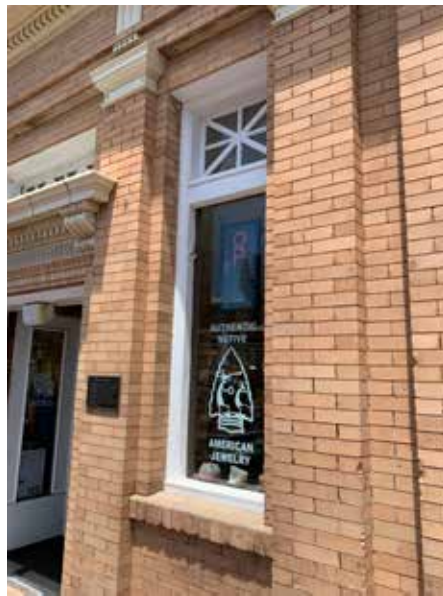
Figure 16: Vertical Window with Transom