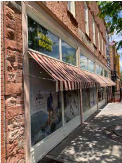
Figure 19: Storefront with Transom Windows