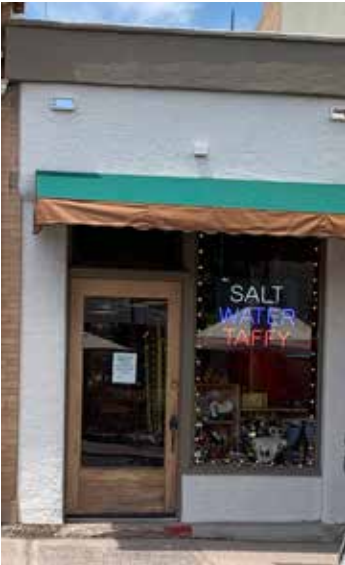
Figure 21: Wood Door (recommended)