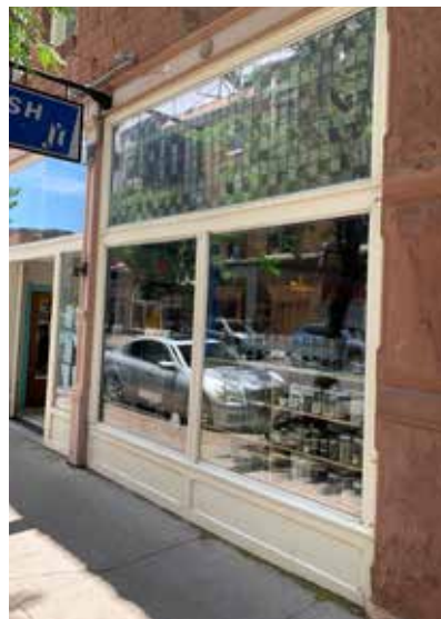
Figure 18: Storefront with Transom