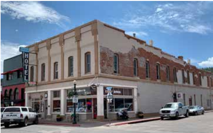
Figure 20: Window to Wall Areas - First and Second Floors