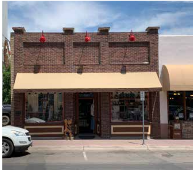
Figure 26: Brick Facade/Wood and Glass Storefront