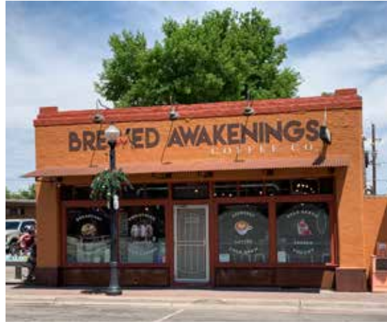
Figure 38: Building and Window Signs