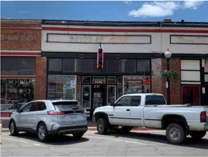
Figure 8: Storefront